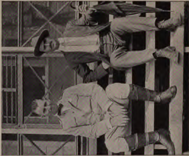
Z. P.'s—plain and otherwise